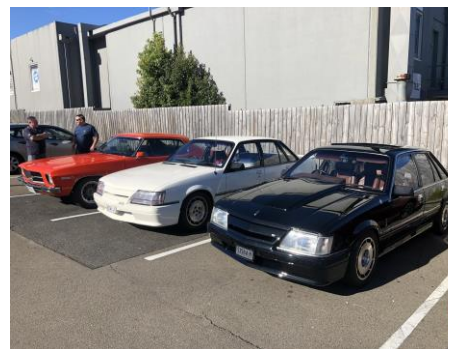
Pie In The Sky run NSW