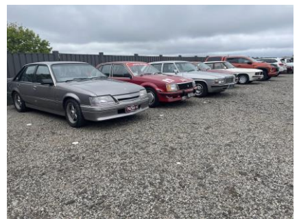
Run to the Pig & Whistle, Trentham East.