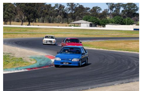
Brocktober 2025 – putting in some track time at Winton