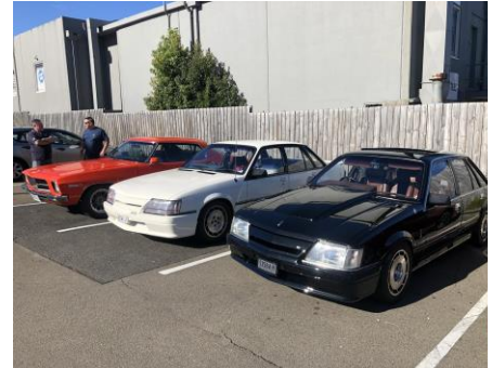
Pie In The Sky run NSW