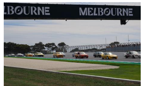
Group C and A hitting the track at Phillip Island Historics